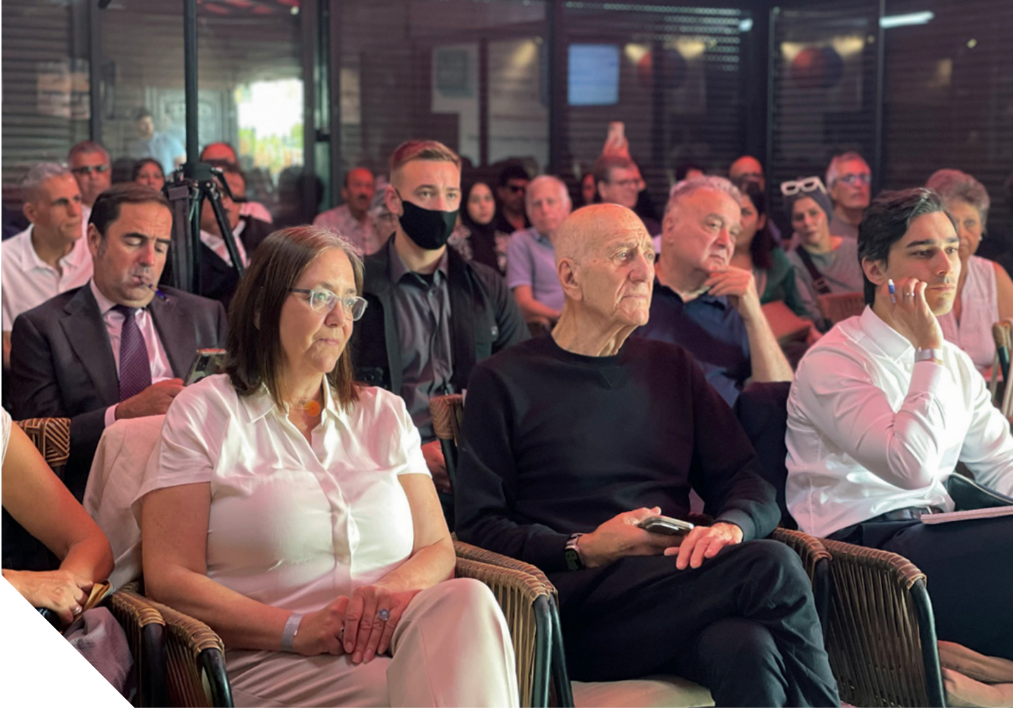
Ehud Olmert, former Israeli Prime Minister, and Kerstin Müller at an event organized by the Middle East Network on November 10, 2025, near Jericho, Palestinian Territories